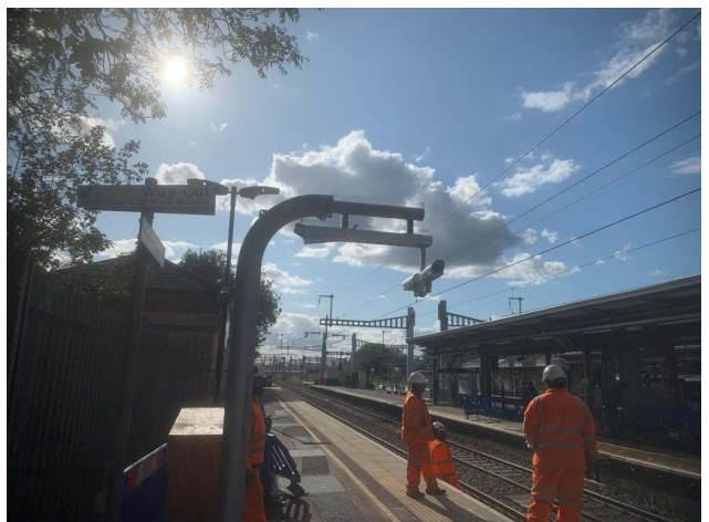
DOO cameras being installed

At Slough we have now completed the DOO and we have almost completed the extensions to Platform 2, 3, 4 and 5 (including lighting).