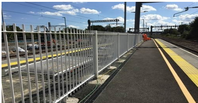
West Drayton platform extensions

At Slough we have now completed the DOO and we have almost completed the extensions to Platform 2, 3, 4 and 5 (including lighting).